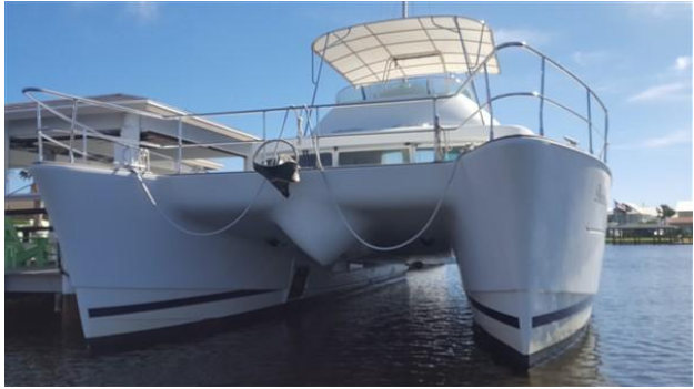
DISCOVERY_Lagoon 43_Powercat_catamaran for sale_justcatamarans_27.jpg