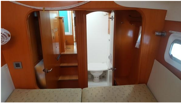
DISCOVERY_Lagoon 43_Powercat_catamaran for sale_justcatamarans_9.jpg