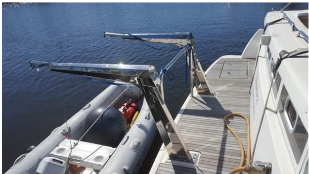
DISCOVERY_Lagoon 43_Powercat_catamaran for sale_justcatamarans_43.jpg