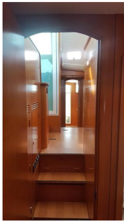
DISCOVERY_Lagoon 43_Powercat_catamaran for sale_justcatamarans_10.jpg