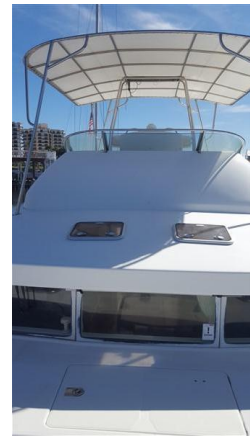
DISCOVERY_Lagoon 43_Powercat_catamaran for sale_justcatamarans_49.jpg