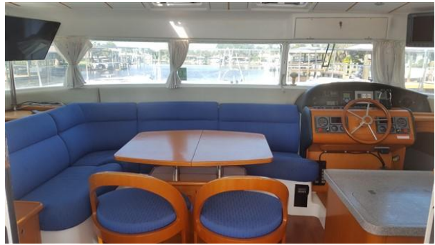
DISCOVERY_Lagoon 43_Powercat_catamaran for sale_justcatamarans_17.jpg