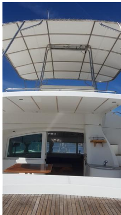
DISCOVERY_Lagoon 43_Powercat_catamaran for sale_justcatamarans_34.jpg