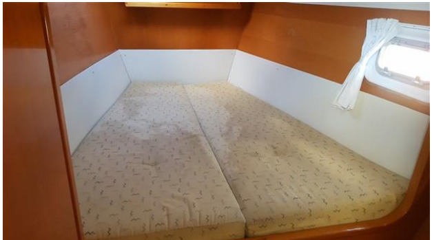
DISCOVERY_Lagoon 43_Powercat_catamaran for sale_justcatamarans_24.jpg