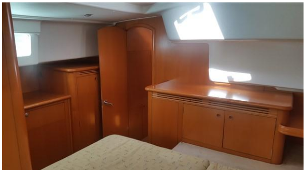
DISCOVERY_Lagoon 43_Powercat_catamaran for sale_justcatamarans_3.jpg