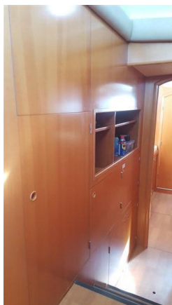
DISCOVERY_Lagoon 43_Powercat_catamaran for sale_justcatamarans_6.jpg