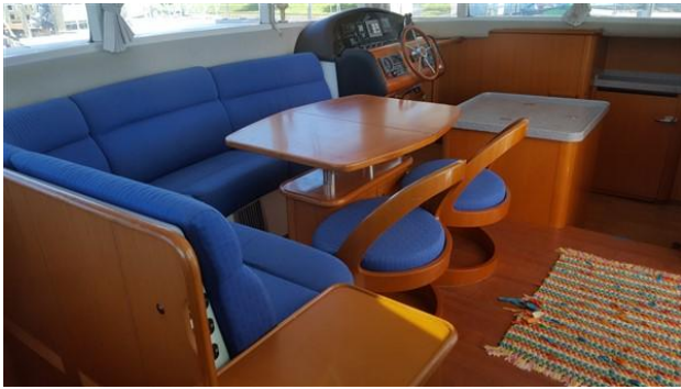
DISCOVERY_Lagoon 43_Powercat_catamaran for sale_justcatamarans_11.jpg