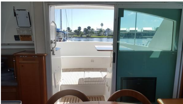
DISCOVERY_Lagoon 43_Powercat_catamaran for sale_justcatamarans_16.jpg