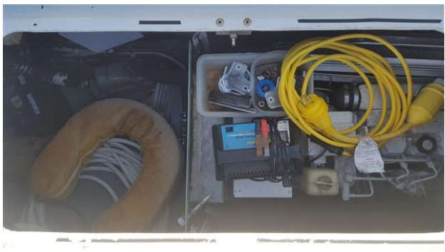
DISCOVERY_Lagoon 43_Powercat_catamaran for sale_justcatamarans_51.jpg