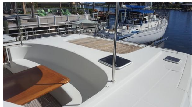
DISCOVERY_Lagoon 43_Powercat_catamaran for sale_justcatamarans_53.jpg