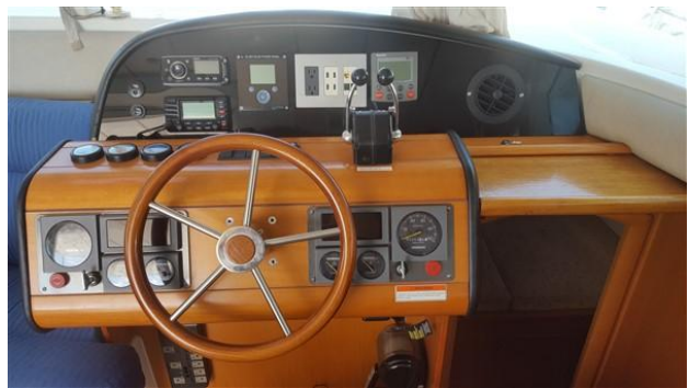
DISCOVERY_Lagoon 43_Powercat_catamaran for sale_justcatamarans_13.jpg