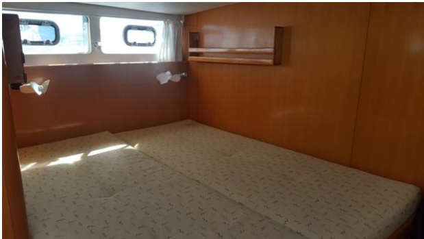
DISCOVERY_Lagoon 43_Powercat_catamaran for sale_justcatamarans_55.jpg