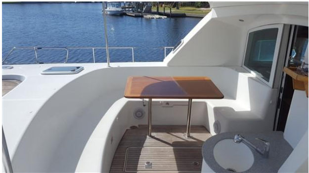
DISCOVERY_Lagoon 43_Powercat_catamaran for sale_justcatamarans_33.jpg