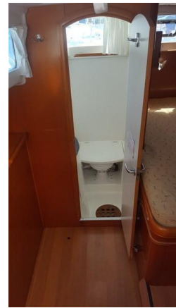
DISCOVERY_Lagoon 43_Powercat_catamaran for sale_justcatamarans_54.jpg