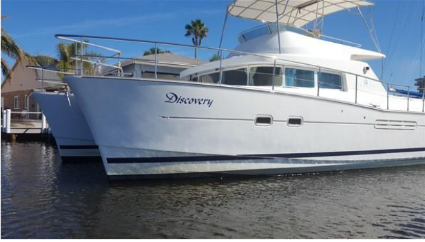
DISCOVERY_Lagoon 43_Powercat_catamaran for sale_justcatamarans_28.jpg