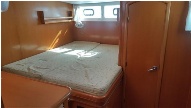
DISCOVERY_Lagoon 43_Powercat_catamaran for sale_justcatamarans_4.jpg