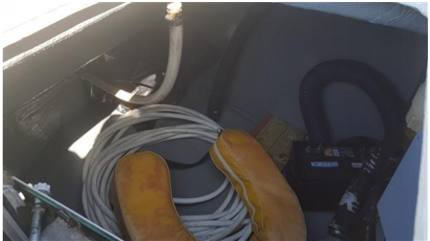
DISCOVERY_Lagoon 43_Powercat_catamaran for sale_justcatamarans_52.jpg