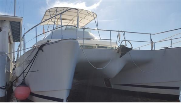
DISCOVERY_Lagoon 43_Powercat_catamaran for sale_justcatamarans_26.jpg