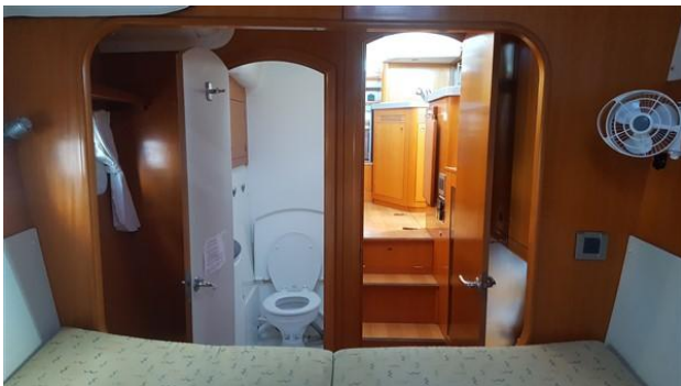
DISCOVERY_Lagoon 43_Powercat_catamaran for sale_justcatamarans_25.jpg