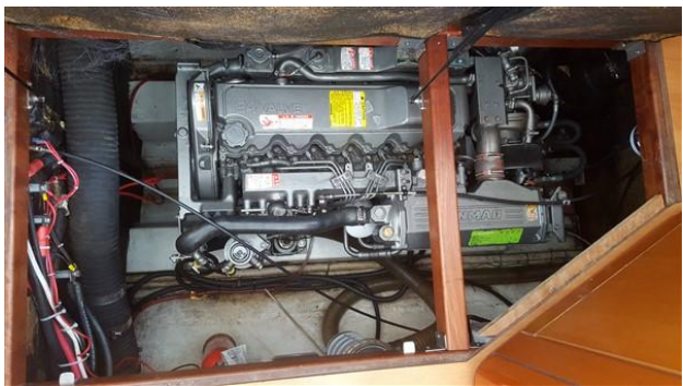
DISCOVERY_Lagoon 43_Powercat_catamaran for sale_justcatamarans_21.jpg