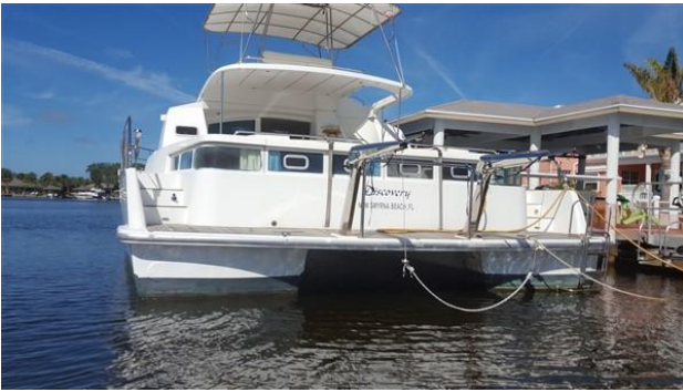
DISCOVERY_Lagoon 43_Powercat_catamaran for sale_justcatamarans_30.jpg