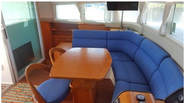
DISCOVERY_Lagoon 43_Powercat_catamaran for sale_justcatamarans_14.jpg