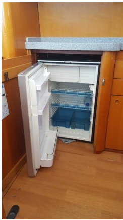
DISCOVERY_Lagoon 43_Powercat_catamaran for sale_justcatamarans_20.jpg