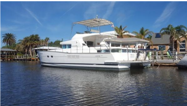
DISCOVERY_Lagoon 43_Powercat_catamaran for sale_justcatamarans_32.jpg