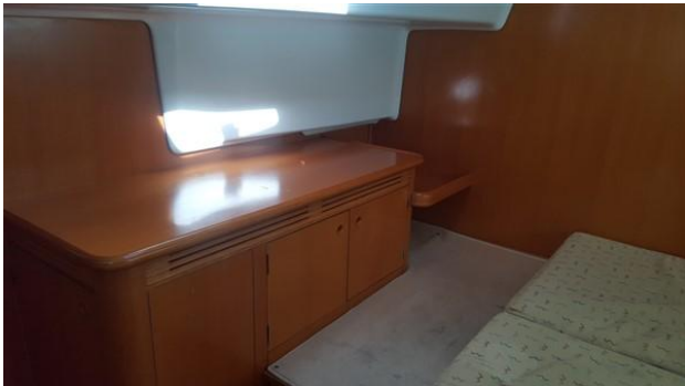
DISCOVERY_Lagoon 43_Powercat_catamaran for sale_justcatamarans_2.jpg