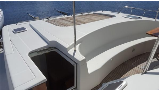
DISCOVERY_Lagoon 43_Powercat_catamaran for sale_justcatamarans_46.jpg