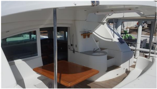
DISCOVERY_Lagoon 43_Powercat_catamaran for sale_justcatamarans_35.jpg