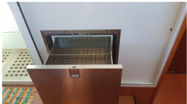
DISCOVERY_Lagoon 43_Powercat_catamaran for sale_justcatamarans_18.jpg