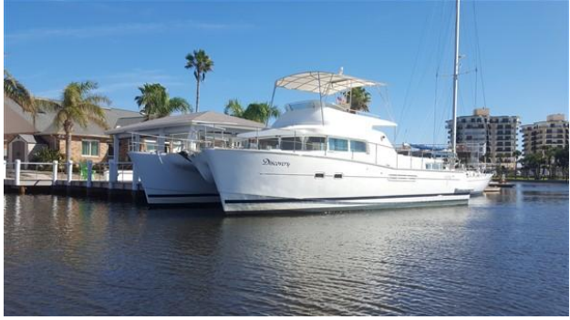
DISCOVERY_Lagoon 43_Powercat_catamaran for sale_justcatamarans_31.jpg