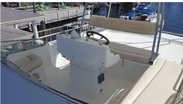
DISCOVERY_Lagoon 43_Powercat_catamaran for sale_justcatamarans_39.jpg