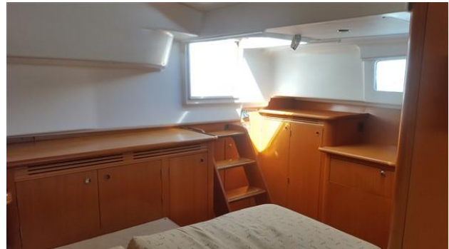
DISCOVERY_Lagoon 43_Powercat_catamaran for sale_justcatamarans_56.jpg