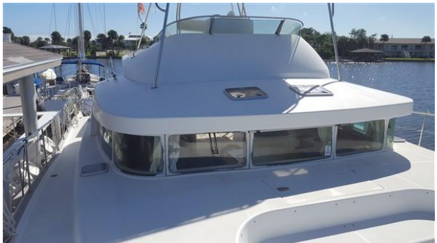
DISCOVERY_Lagoon 43_Powercat_catamaran for sale_justcatamarans_47.jpg