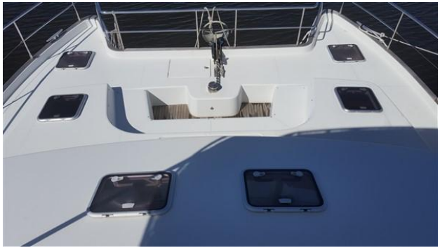
DISCOVERY_Lagoon 43_Powercat_catamaran for sale_justcatamarans_41.jpg