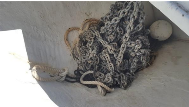
DISCOVERY_Lagoon 43_Powercat_catamaran for sale_justcatamarans_50.jpg