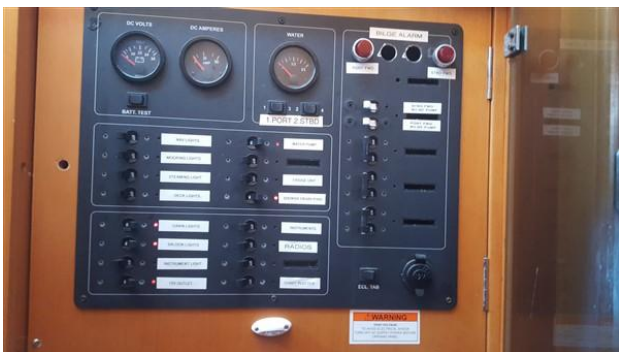
DISCOVERY_Lagoon 43_Powercat_catamaran for sale_justcatamarans_23.jpg