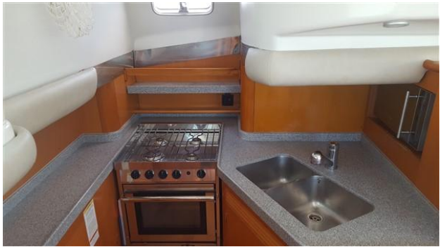
DISCOVERY_Lagoon 43_Powercat_catamaran for sale_justcatamarans_19.jpg