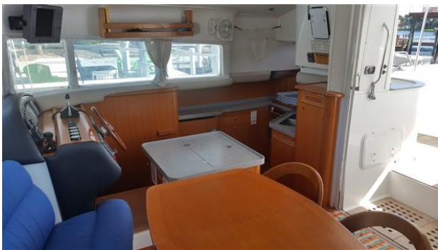
DISCOVERY_Lagoon 43_Powercat_catamaran for sale_justcatamarans_15.jpg