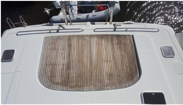
DISCOVERY_Lagoon 43_Powercat_catamaran for sale_justcatamarans_42.jpg