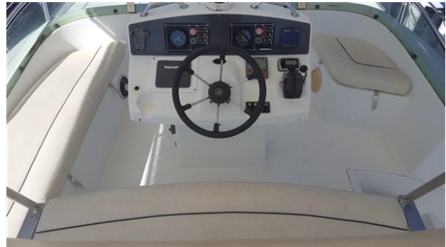
DISCOVERY_Lagoon 43_Powercat_catamaran for sale_justcatamarans_40.jpg