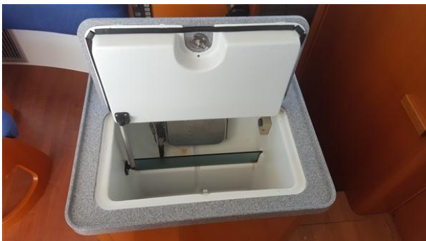
DISCOVERY_Lagoon 43_Powercat_catamaran for sale_justcatamarans_12.jpg