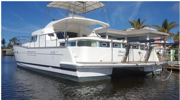
DISCOVERY_Lagoon 43_Powercat_catamaran for sale_justcatamarans_29.jpg