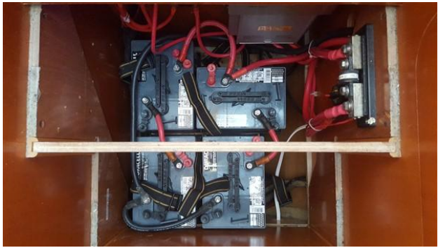
DISCOVERY_Lagoon 43_Powercat_catamaran for sale_justcatamarans_22.jpg