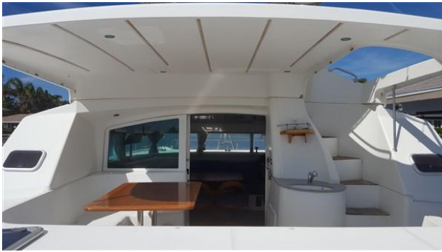
DISCOVERY_Lagoon 43_Powercat_catamaran for sale_justcatamarans_36.jpg