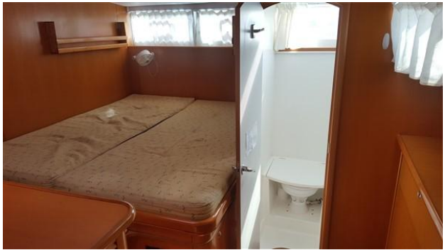
DISCOVERY_Lagoon 43_Powercat_catamaran for sale_justcatamarans_1.jpg