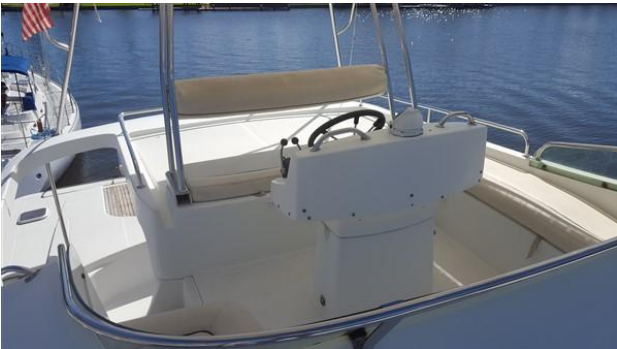
DISCOVERY_Lagoon 43_Powercat_catamaran for sale_justcatamarans_38.jpg