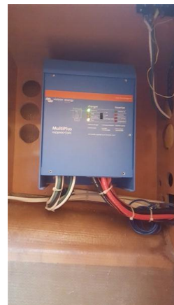
DISCOVERY_Lagoon 43_Powercat_catamaran for sale_justcatamarans_7.jpg