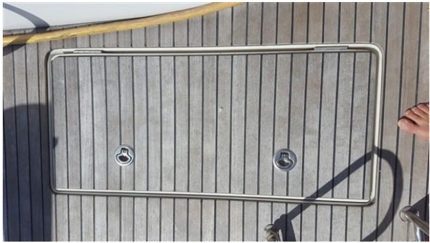
DISCOVERY_Lagoon 43_Powercat_catamaran for sale_justcatamarans_44.jpg