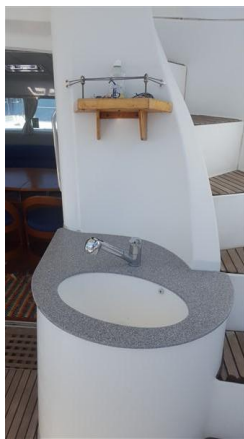
DISCOVERY_Lagoon 43_Powercat_catamaran for sale_justcatamarans_37.jpg