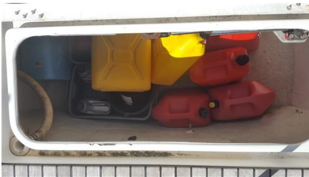
DISCOVERY_Lagoon 43_Powercat_catamaran for sale_justcatamarans_45.jpg