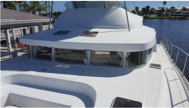
DISCOVERY_Lagoon 43_Powercat_catamaran for sale_justcatamarans_48.jpg