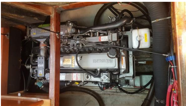
DISCOVERY_Lagoon 43_Powercat_catamaran for sale_justcatamarans_5.jpg