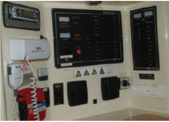
> 2001-Leopard-42-catamaran-for-sale-navigation station.jpg