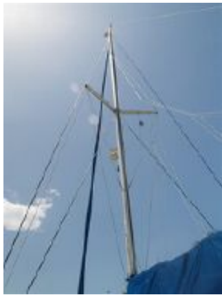
> CALYPSO_Leopard 42_catamaranm for sale_just catamarans_mast.jpg