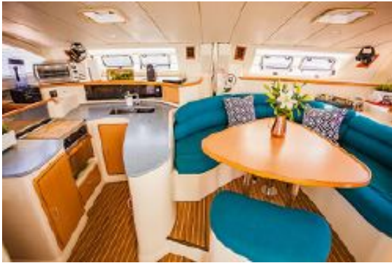
> CALYPSO_Leopard 42_catamaran for sale_just catamarans_saloon and galley