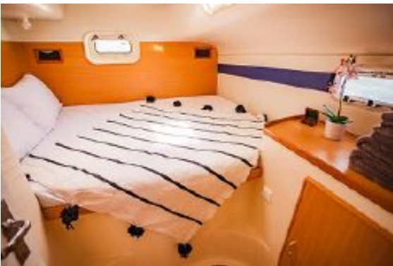
> CALYPSO_Leopard 42_catamaran for sale_justcatamarans_cabin 2