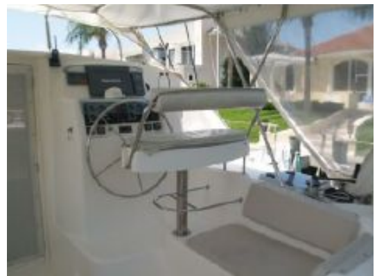
> 2001-Leopard-42-catamaran-for-sale-helm st