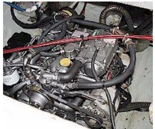
> CALYPSO_Leopard 42_catamaranm for sale catamarans_engine.jpg