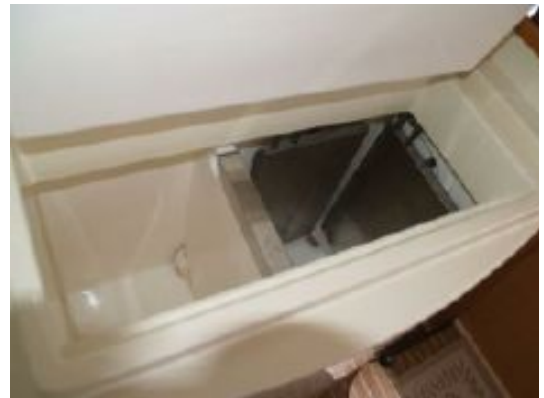
> 2001-Leopard-42-catamaran-for-sale-fridge fre