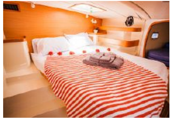
> CALYPSO_Leopard 42_catamaran for sale catamarans_cabin