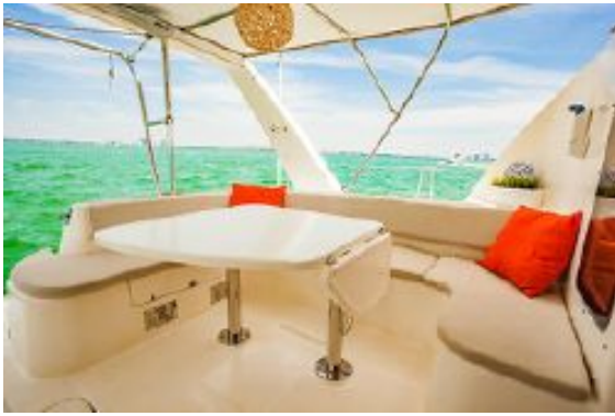
> CALYPSO_Leopard 42_catamaran for sale_just catamarans_cockpit