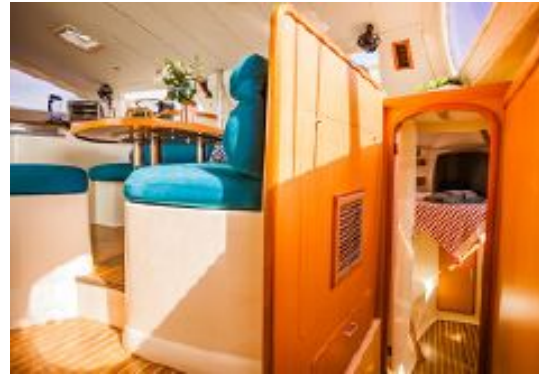
> CALYPSO_leopard 42_catamaran for sale catamarans_hull