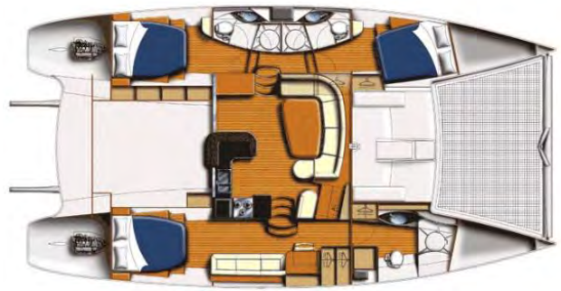
3 Cabin Layout