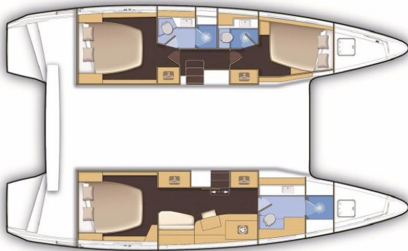
Version 3 cabines / 3 cabin version