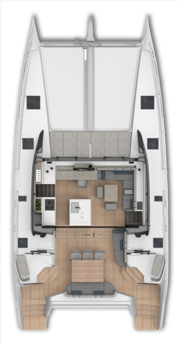
Visuals not contractual